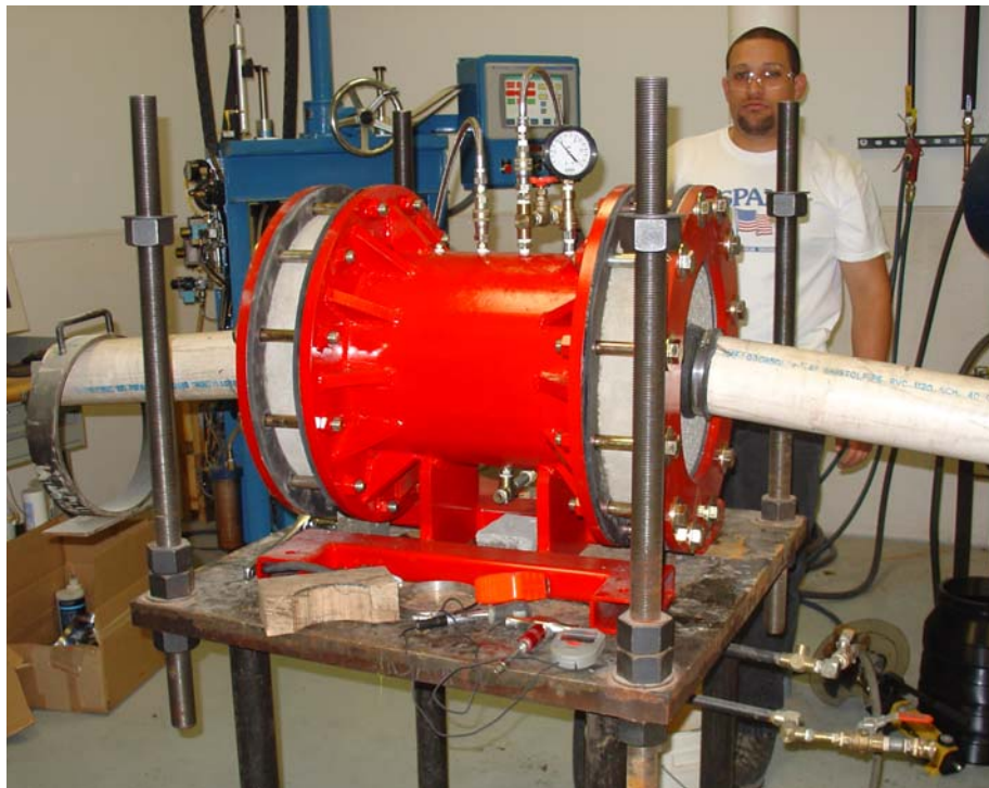
Test Fixture allows simultaneous testing of Infiltration (left) and Exfiltration (right) connector orientations (Angular Deflection Test shown)