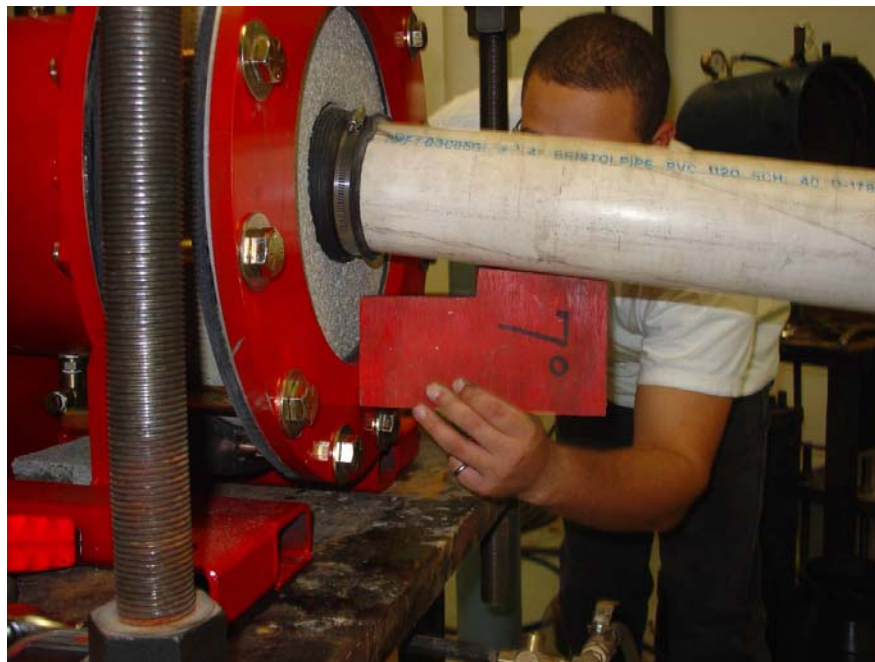
Test Set-Up for Angular Deflection (Exfiltration orientation shown)