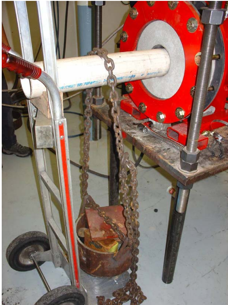
Test Set-Up for Shear Load (Infiltration orientation shown)