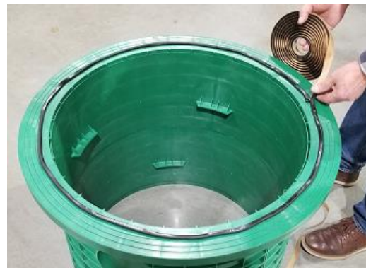
Firmly press the butyl to the TAR to form a full ring.