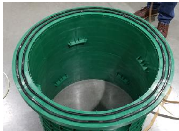
Form a second full ring of butyl. Flip the TAR over and press it firmly to the septic tank surface. Butyl should be minimum 3/8", butyl ends should be kneaded together